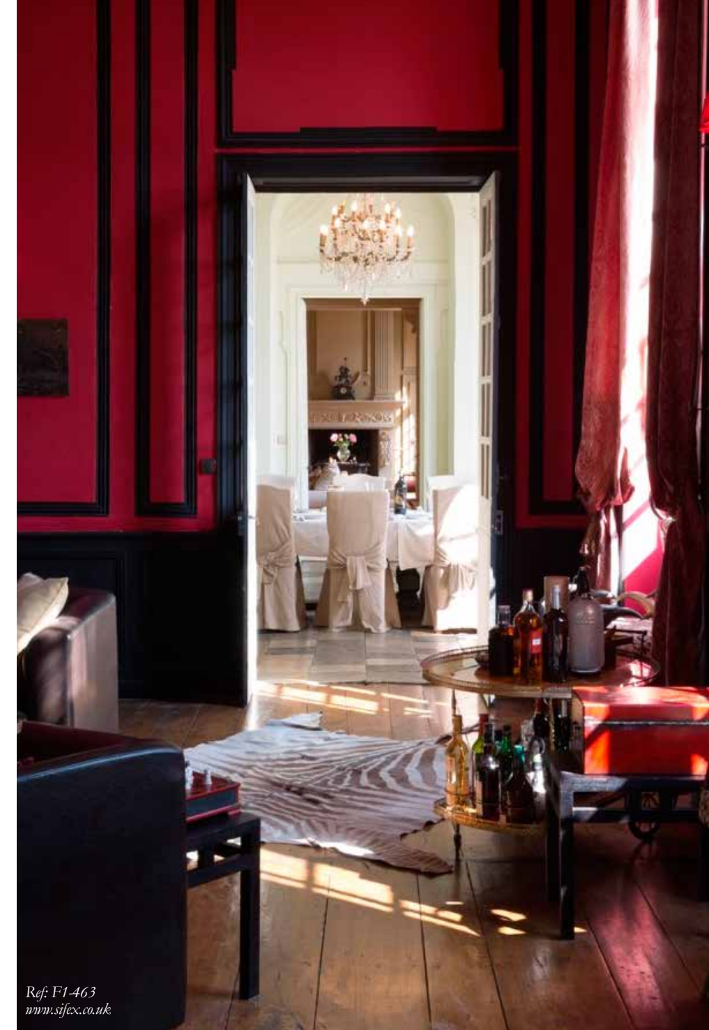
Ref: F1-463 www.sifex.co.uk

Would-be Château owners embarking on a quest to realise their dream, need stamina and